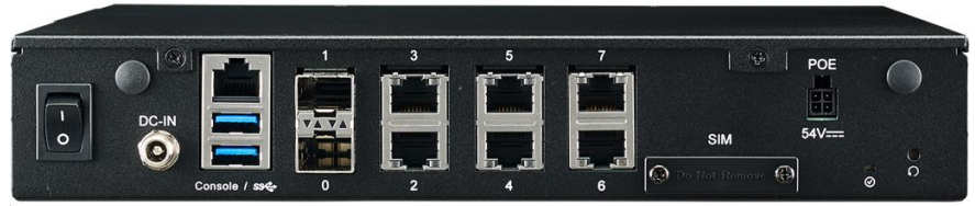
Advantech FWA-1012VC Rear Ports

All models include an optional trusted platform module (TPM) that acts as the root of trust for security certificates. Communication Service Providers can scale their Mercury uCPE deployments with Advantech's FWA-3050, an Intel® Select Solution for uCPE based on the Intel® Xeon® D-2100 processor , this further scales up whitebox uCPE choice and provides the extra throughput, VNF onboarding and processing headroom that CSPs and Enterprises need to efficiently address increasing on-premise workloads.