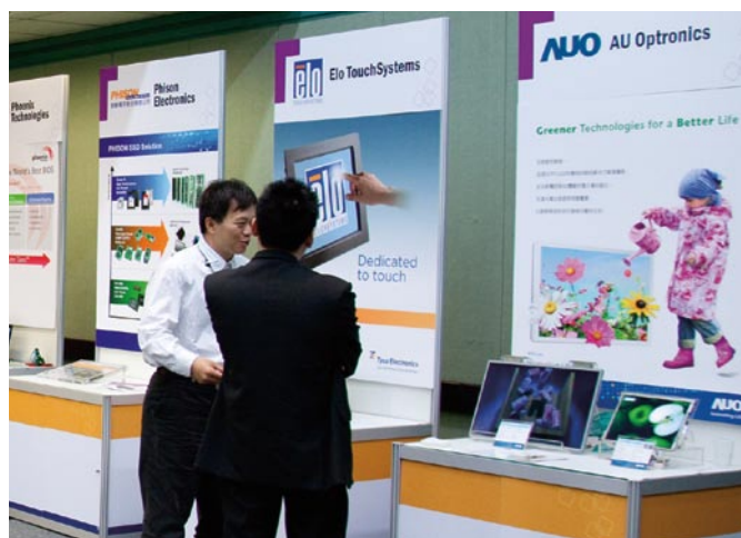
Booth showcase, ADF Taipei in TICC, March 3

Right now, Projected Capacitive Touch technology is the mainstream technology used for the large touchscreens but the price is too high for embedded applications. The best solutions for embedded markets are infrared and SAW because of their high light transmission and low cost advantages.