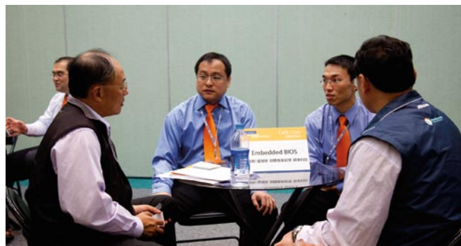
Cafe Chat: Talk with the experts - Embedded BIOS

ADF helps everyone take advantage of changing technology and advances business success through collaboration with other industry leaders and experts. As a leader, Advantech demonstrates its commitment to developing advanced services and platforms that give our customers the edge.