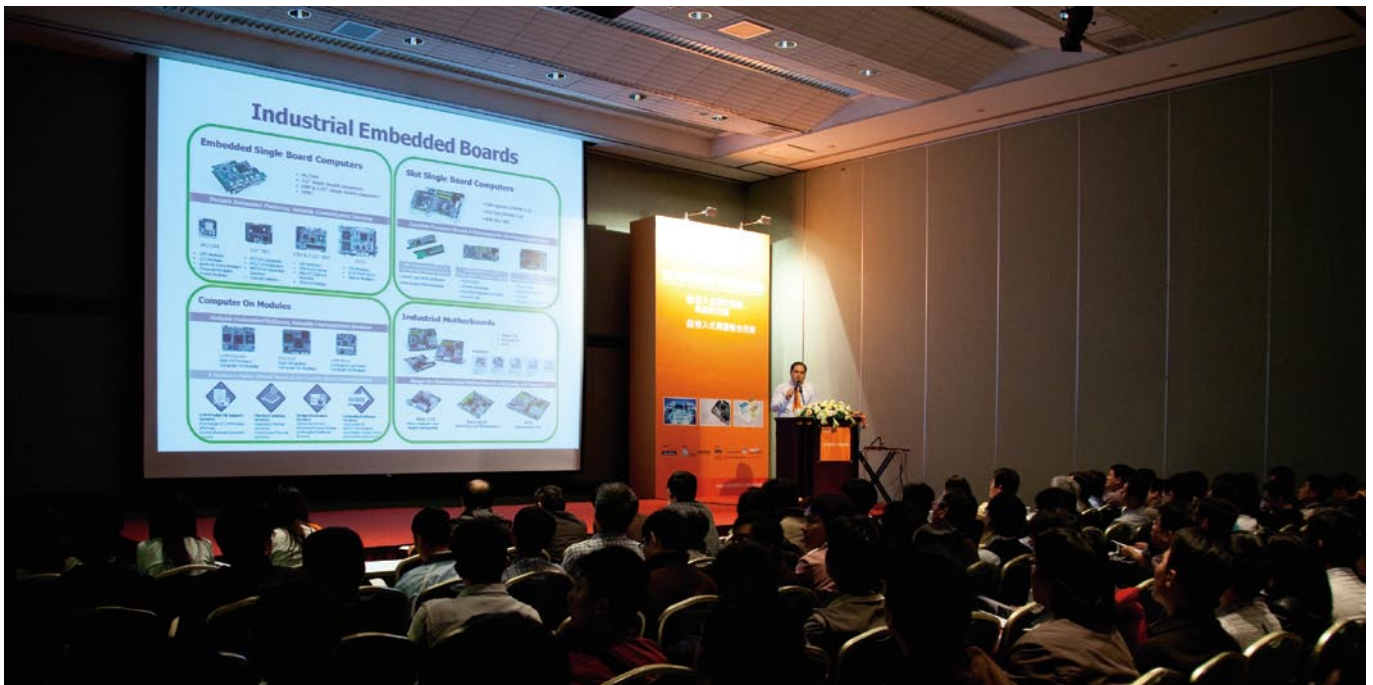
Aaron Su, Product Manager, Advantech, presenting the technology session: Techniques for Embedded Design-In

In November, Advantech will launch a new product range based on future Intel® Atom™ processors with ultra low power consumption of around 5.5 Watts, and new products based on PC/104, 3.5", COM-Ultra and Q7 form factors. Advantech aims to provide the very latest processor and chipset platforms to achieve faster times to market.