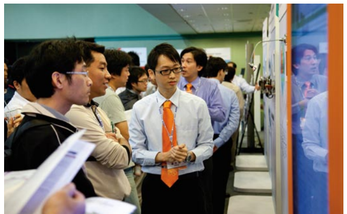
Booth Showcase, ADF Taipei in TICC, March 3