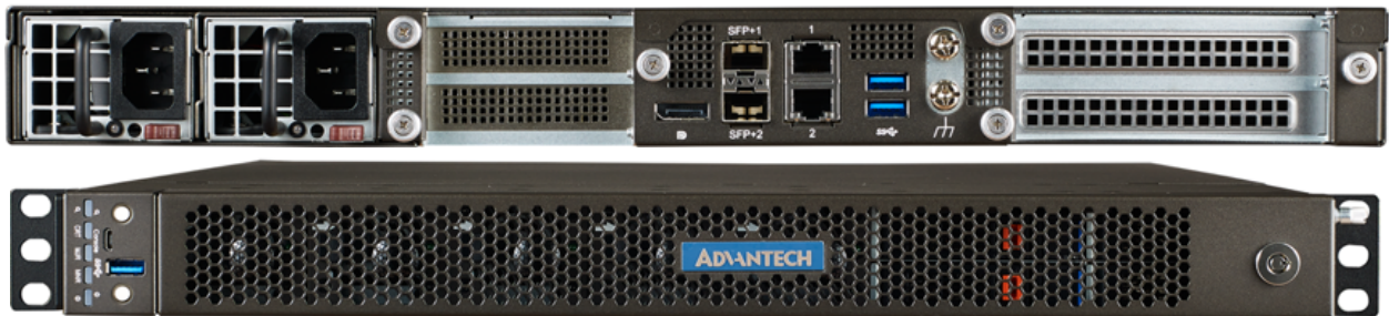
Figure 3. Front and back views of the Advantech SKY-8101 server. 2

The primary model for vBRAS applications is the SKY-8101, a 1RU, single-socket server that can scale to 28 cores and supports configurations across the entire range of Intel Xeon Scalable processors. The server supports six DIMM sockets to enable high capacity six-channel configurations providing fast memory access. The SKY-8101 PCIe subsystem offers abundant I/O expansion with slots for three PCIe x8 Gen3 adapters—two full height, full length and one low profile—in addition to onboard NICs and one further PCIe x4 Gen3 slot for Advantech personalization cards.