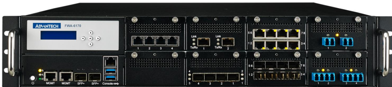
Figure 1. Advantech FWA-6170 with 7 out of 8 Network Mezzanine Cards (NMC) slots populated